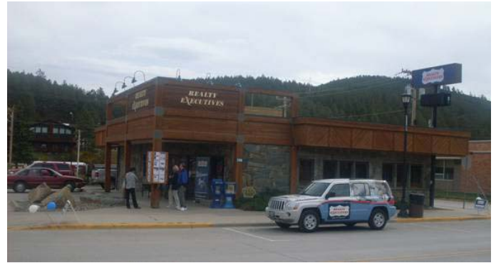
Hill City, South Dakota