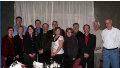
Fargo Executives at their Holiday Party